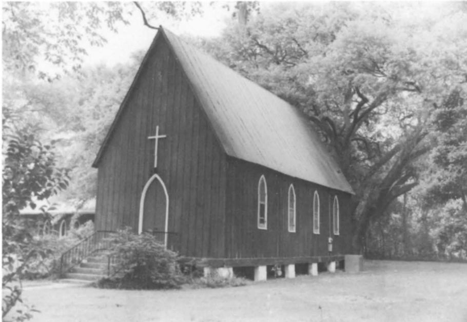
Criteria Consideration A - Religious Properties. A religious property can qualify as an exception to the Criteria if it is architecturally significant. The Church of the Navity in Rosedale, Iberville Parish, Louisiana, qualified as a rare example in the State of a 19th century small frame Gothic Revival style chapel. (Robert Obier)