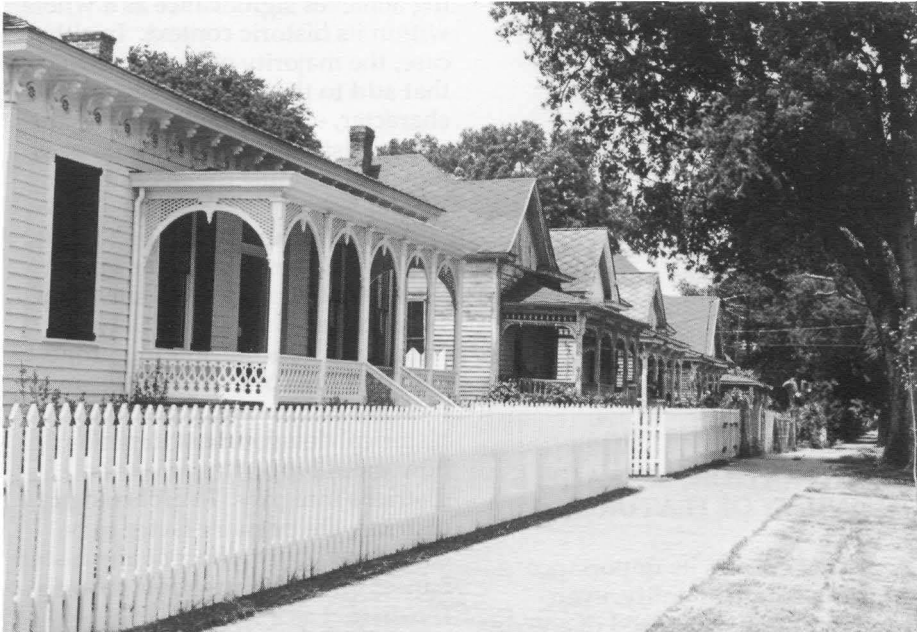
Ordeman-Shaw Historic District, Montgomery, Montgomery County, Alabama. Historic districts derive their identity from the interrelationship of their resources. Part of the defining characteristics of this 19th century residential district in Montgomery, Alabama, is found in the rhythmic pattern of the rows of decorative porches.

business districts canal systems groups of habitation sites college campuses estates and farms with large acreage/ numerous properties industrial complexes irrigation systems residential areas rural villages transportation networks rural historic districts