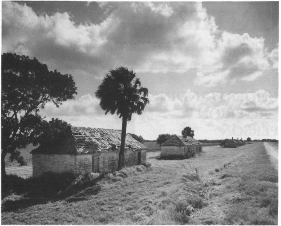
Criterion A - The Old Brulay Plantation, Brownsville vicinity, Cameron county, Texas. Historically significant for its association with the development of agriculture in southeast Texas, this complex of 10 brick buildings was constructed by George N. Brulay, a French immigrant who introduced commercial sugar production and irrigation to the Rio Grande Valley. (Photo by Texas Historical Commission).